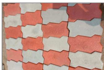
Hindusthan Zig Zag (60 & 80 MM) Area per Tile: 0.35 Size : 250x125 MM