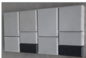
Hindusthan 5 Pieces Combo (60 MM) 5 Pieces : 2.00 SqFt Size : 200x275 MM, 200x225 MM, 200x175 MM, 200x125 MM, 200x100 MM