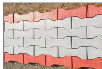
Hindusthan I Paver (60 MM) Area per Tile: 0.40 Size : 270x188 MM

Regd. Office : Sy. No. 497/E/1, Korremula Villeg, Ghatkesar Mandal, Medchal Dist, Telangana State, India